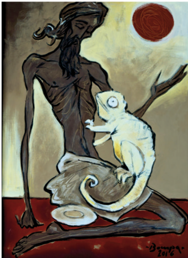
The White Chameleon, 2016 acrylic on canvas 50x70cm