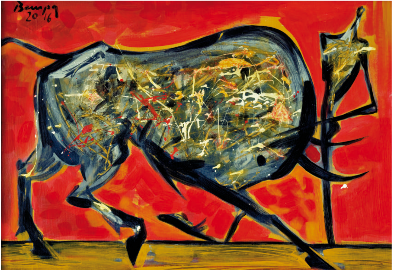
Tauromahia , 2016 acrylic on canvas 70x50cm