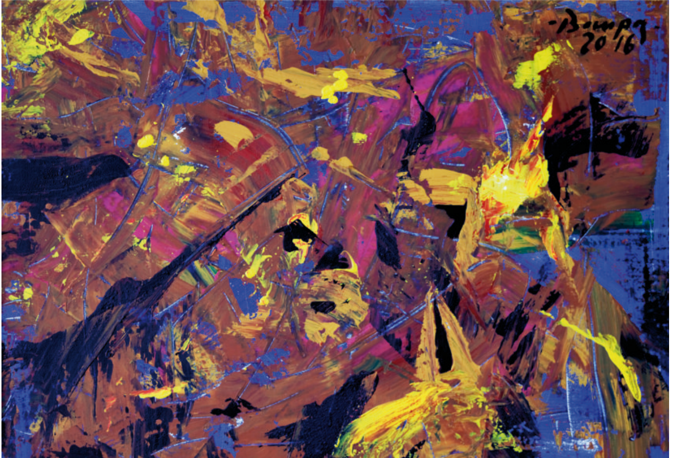
Phoenix, 2016 acrylic on canvas 95x70cm