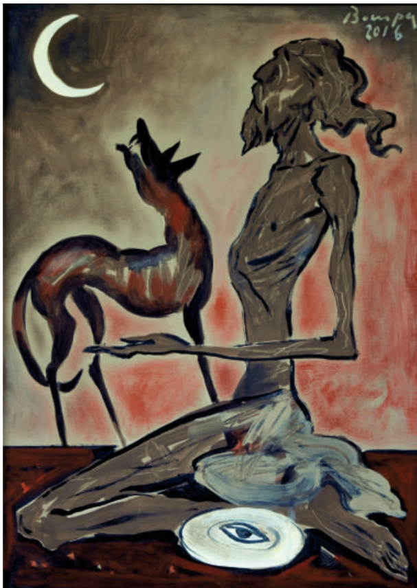
Lycanthropy, 2016 acrylic on canvas 50x70cm