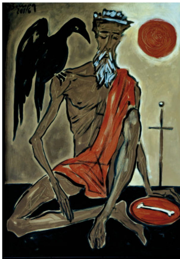
King and Raven, 2016 acrylic on canvas 50x70cm